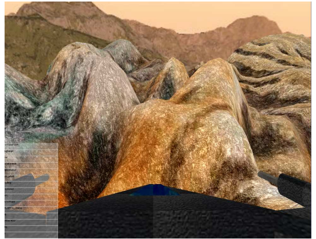
Figure 1: Screenshot of our multi-player game

A problem inherent in distributed games is inconsistency. Local changes to the state of a game through user interaction must be transmitted over the network to the other instances. Such a transmission is subject to a delay and delay jitter. This means that it is no longer guaranteed that the ordering of actions performed at two different sites will be retained after being sent to the other instances of the game. Confusing up the order in which events take place induces an inconsistency and necessitates consistency control mechanisms [11, 16].